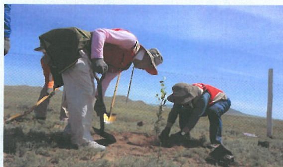
Tree planting in Mongolia on 13 June 2014

very amicable atmosphere. It is envisaged that the event will significantly contribute to raising the awareness of the issue as well as strengthening cooperation with Mongolia.