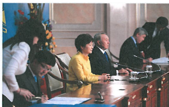
Signing of MOU, attended by the Presidents of Korea and Kazakhstan

President Park Geun-hye of ROK took a visit to three Central Asian nations – first to Uzbekistan and then to Kazakhstan and Turkmenistan.