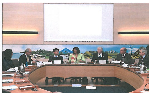
Launch of the FAO Forest and Landscape Restoration Mechanism during FAO-COFO 2014

On the second day of COFO 2014, the Korean delegation attended a side-event celebrating the launch of the FAO Forest and Landscape Restoration Mechanism.