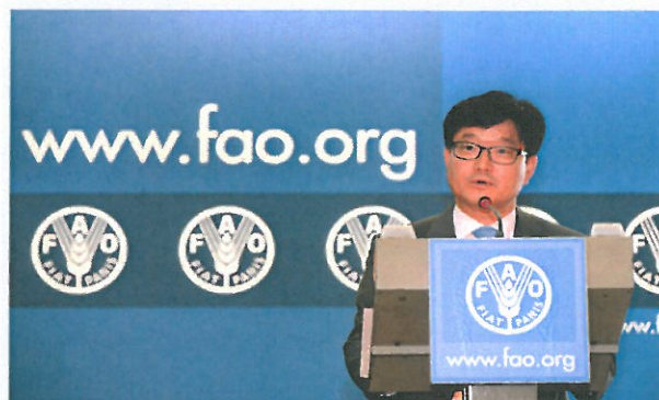
Keynote speech by Minister of KFS

Under this MoU, the KFS and FAO will work together on areas including forest and landscape restoration, sustainable forest management, climate change mitigation and adaptation, and forest health and protection.