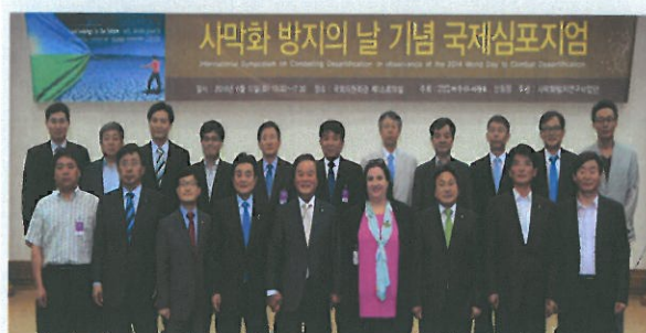
International Symposium on Combating Desertification on 10 June 2014