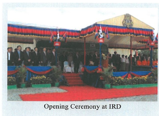
Opening Ceremony at IRD

On the same day, the opening ceremony of the Institute of Forest and Wildlife Research and Development (IRD) took place on May 7 th , which was established in Cambodia with the support of the Government of Korea, and distinguished participants from both countries celebrated this significant cooperation between the two countries.