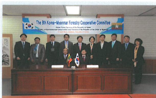
The 8 th meeting of Korea-Myanmar FCC

The eighth meeting of the Korea-Myanmar Forestry Cooperative Committee was held between the Korea Forest Service (KFS) and the Ministry of Environmental Conservation and Forestry (MOECAF) of Myanmar in Daejeon, on 8 April 2014. The Korean delegation was headed by H.E. Dr. Shin Won Sop, Minister of the KFS and the Myanmar delegation by H.E. U Win Tun, Union Minister.