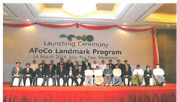
Launching of the AFoCo Landmark Program