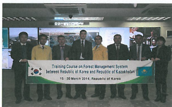
Kazakhstan Specialists Visiting the KFS

These specialists visited the major forest organizations and institutes of Korea, including the Korea Forest Service, the Korea Forest Research Institute, the Korea National Arboretum, the National Forest Seed and Variety Center, and the AFoCo Secretariat. Beginning with this visit, it is expected that there will be more vigorous forest activities between two countries.