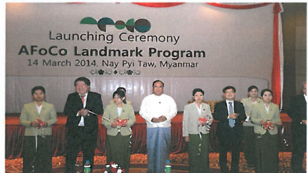
Ribbon-cutting ceremony at the Launching

The Launching Ceremony for the AFoCo Landmark Program was held in the capital city of the Republic of Union of Myanmar, Nay Pyi Taw, on 14 March 2014. Many distinguished guests from the ASEAN member states had participated to this ceremony.