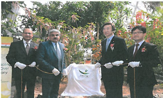
Unveiling Ceremony of the information board

The presented sapling is a direct descendent of the sacred Bodhi tree under which Buddha achieved the enlightenment. This symbolic sapling is of the third presentation by the Government of the Republic of India following the previous gifts to Thailand and Sri Lanka.