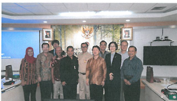
The 2 nd JSC on Korea-Indonesia FMU/REDD+ Joint Project

The 2 nd Joint Steering Committee (JSC) for the Korea-Indonesia FMU / REDD+ Joint Project in Tasik Besar Serkap was held on 19 March, 2014 at the Ministry of Forestry in Jakarta, Indonesia.