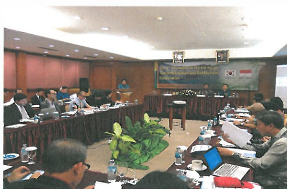
The 2 nd Int'l Workshop on Forest Recreation and Ecotourism

As a follow up action to the MOU between the Republic of Korea and the Republic of Indonesia signed by the two leaders on cooperation in forest recreation and ecotourism in 2013, the Second International Workshop on Forest Recreation and Ecotourism was held in Indonesia from 20 to 21 March, 2014. The Workshop provided an opportunity for both sides of the governments, academia, and private sectors to exchange opinions and discuss the direction of the Master Plan 2014.