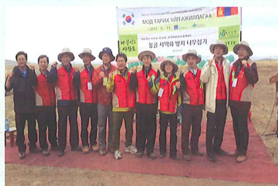
Tree Planting Event in Mongolia

Initially this Green Belt Project was agreed at the Korea-Mongolia Summit in 2006. With on-going efforts in implementing projects for preventing desertification and dust and sandstorms in Mongolia and China, this Korea-Mongolia Green Belt Project is being implemented in support of the green belt program of Mongolia. The Project scheduled from 2007 to 2016 aims to plant trees on 3,000 ha with the view of combating desertification.