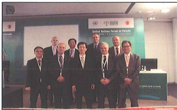
The Side Event at 10 th UNFF

Presentations and discussions were carried out during the Side Event on “Forest and Landscape Restoration : Promising Examples in support of the Bonn Challenge” which was attended by about 100 representatives from Member States and international organizations.