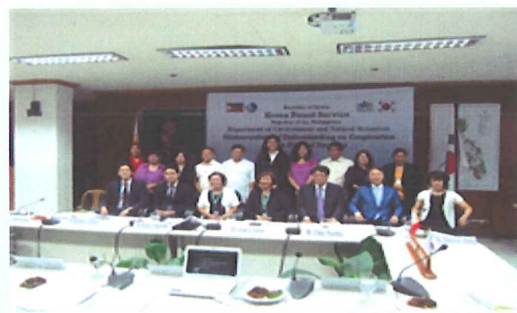
The First Meeting of the First Korea-Philippines Forest Cooperative Committee