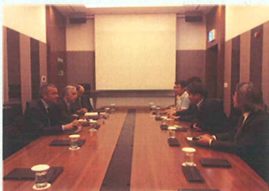
The Meeting between Algerian and KFS officers

During their field studies, several meetings were made with concerned Korean officers and focused on how to forge a strategic master plan, including basic investigation, feasibility study, factor analysis, etc. The Algerian side ensured that a draft plan will be prepared within three months based on onsite studies, and both sides highlighted the need for the continued collaboration on developing a practical master plan.