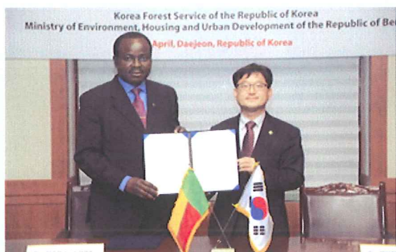
The Signing of the Agreed Minutes of the First Korea-Benin Forest Cooperative Committee

The first meeting opened up a new partnership between the two countries and both sides showed determined commitments to enhancing the forest cooperation.