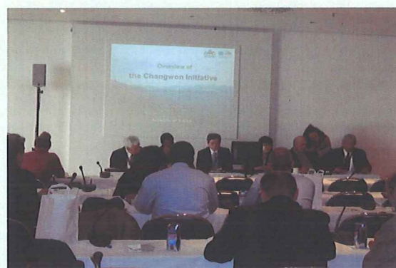
Side event on LDNW

The Changwon Initiative was proposed by the Republic of Korea during the High Level Segment of the 10 th session of the Conference of the Parties (COP 10) to the UNCCD with the aim of providing an action-oriented approach towards the implementation of the Convention and the Strategy as well. For the Changwon initiative, it was discussed this time on 2013 contributions and action plans and also agreed to make 1.20 million USD of voluntary contributions.